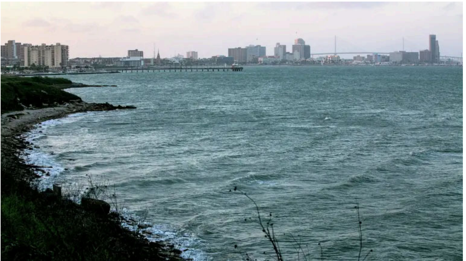
The city of Corpus Christi is seen on March 4.

For now, Corpus Christi remains at the mercy of rain. Almost all of the city's emergency water supply projects are hung up with complications and delays. Last week, a state administrative judge sent the permits for Corpus Christi's largest emergency project, in Sinton, about 25 miles north, into a hearing process that could take years.