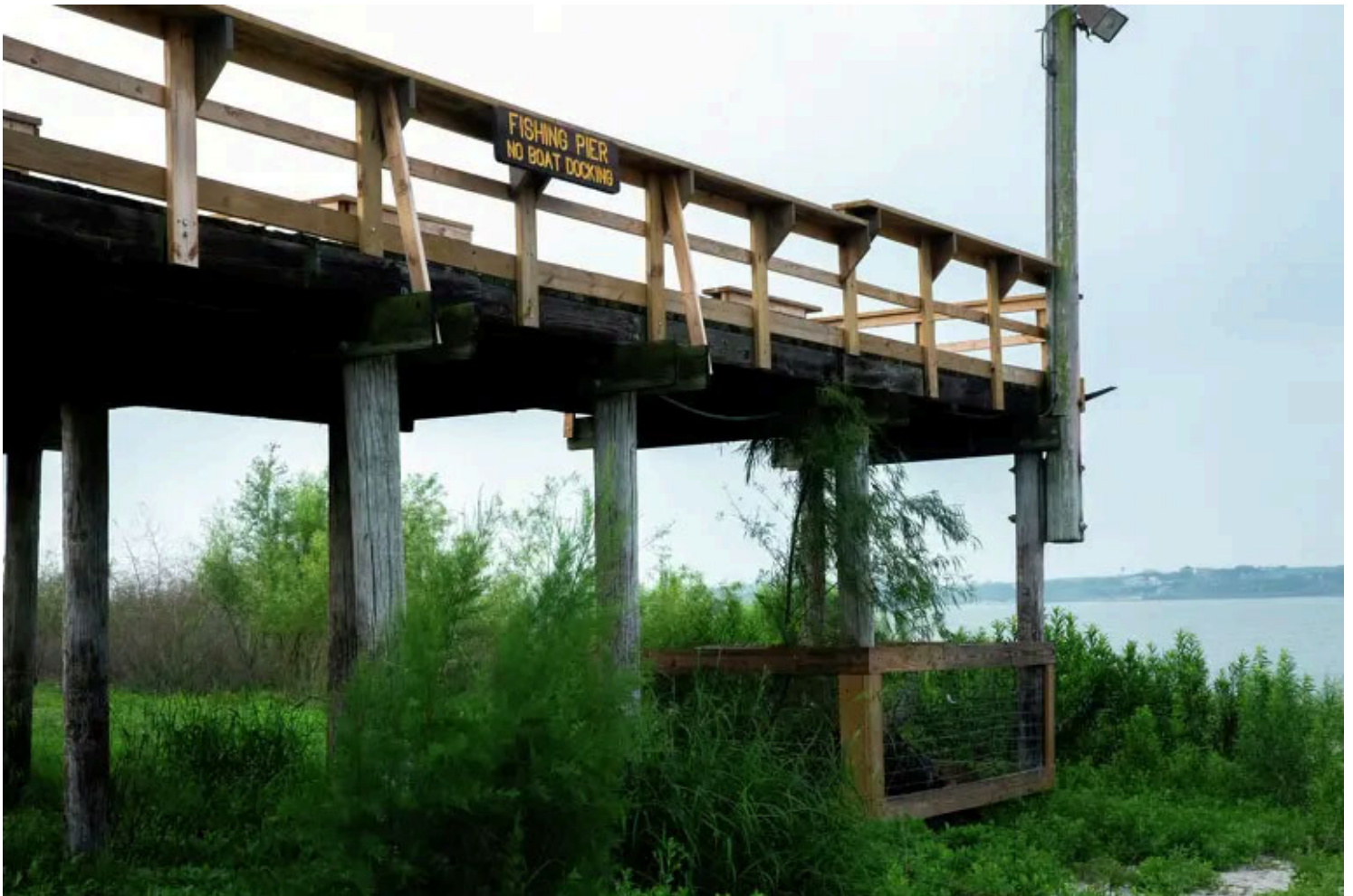
Water sits 30 or more feet below the base of a fishing pier at Lake Corpus Christi on April 28.