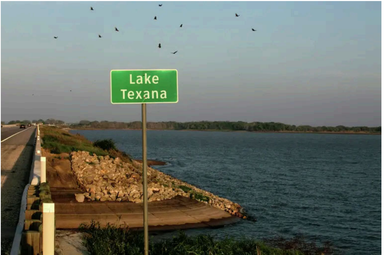
Corpus Christi's largest remaining reservoir, Lake Texana, is currently 55% full and projected to hit 30% this summer.

CORPUS CHRISTI — Recent rainfall in South Texas has pushed back the projected date of emergency water restrictions in Corpus Christi by three months amid growing hope that a powerful global climate phenomenon this year could wash away the region's historic drought.