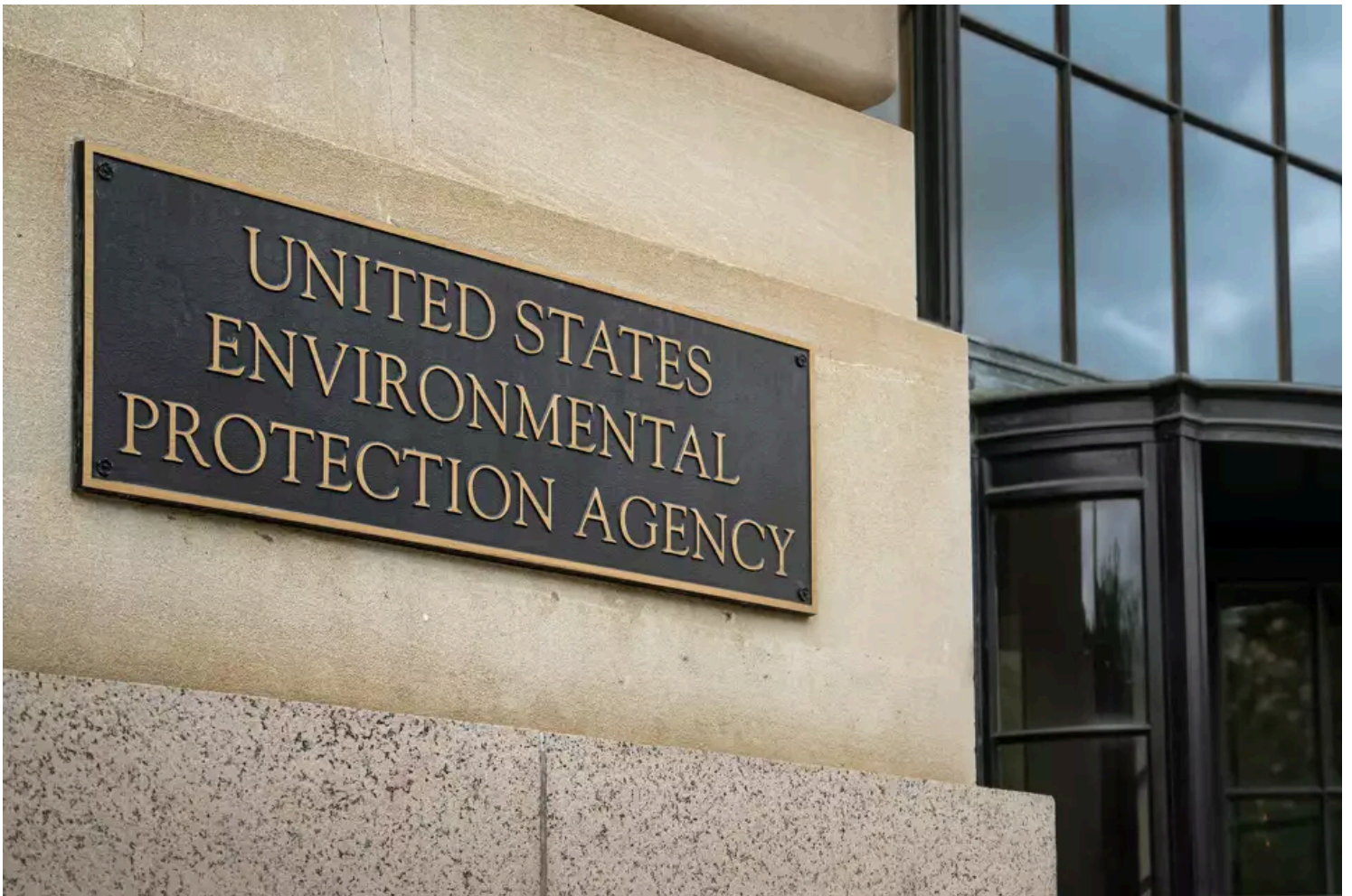
Plaque sign on the outside of the United State Department of Education in Washington D.C.

Texas' multi-year effort to receive primacy over Class VI underground injection wells is nearing its conclusion. ✕