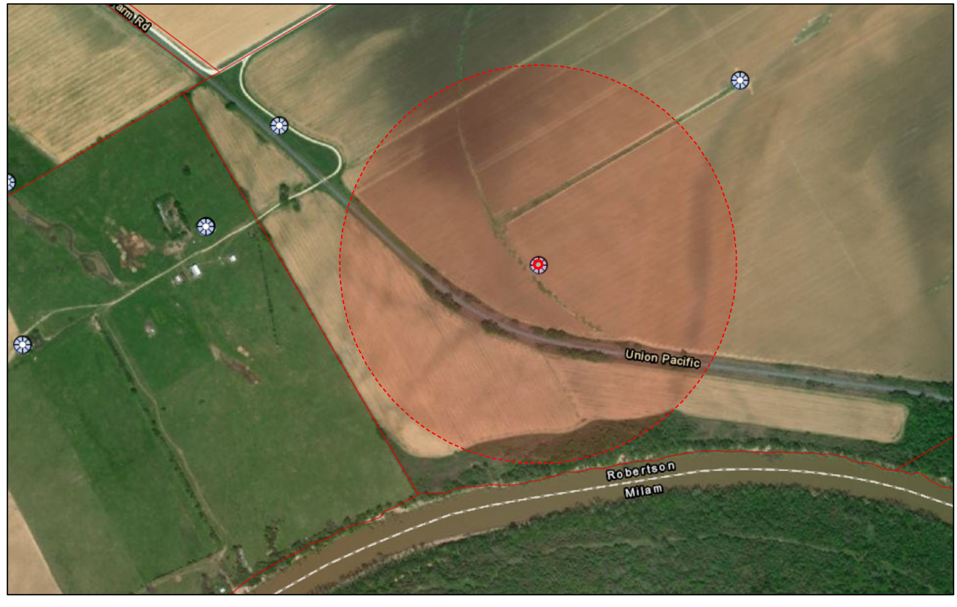
James C. Brien | BVDO-0315 | Well #2 | Simsboro | 2,186 ac-ft/yr | 1355.82' radius